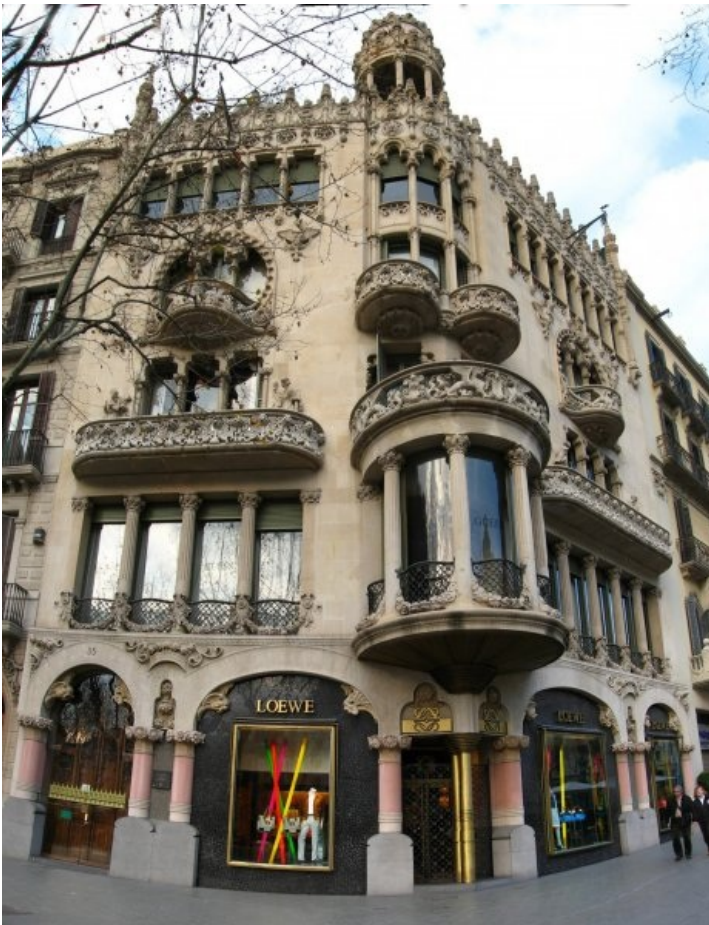
Casa Lleó-Morera (designed by Lluís Domènech i Montaner)

From Plaça Catalunya, walk up Passeig de Gràcia into the Eixample neighborhood. On this street between Carrer del Consell de Cent and Carrer d'Aragó you'll find the famous "Block of Discord"—a stretch of street featuring a number of surreal-looking modernisme buildings.