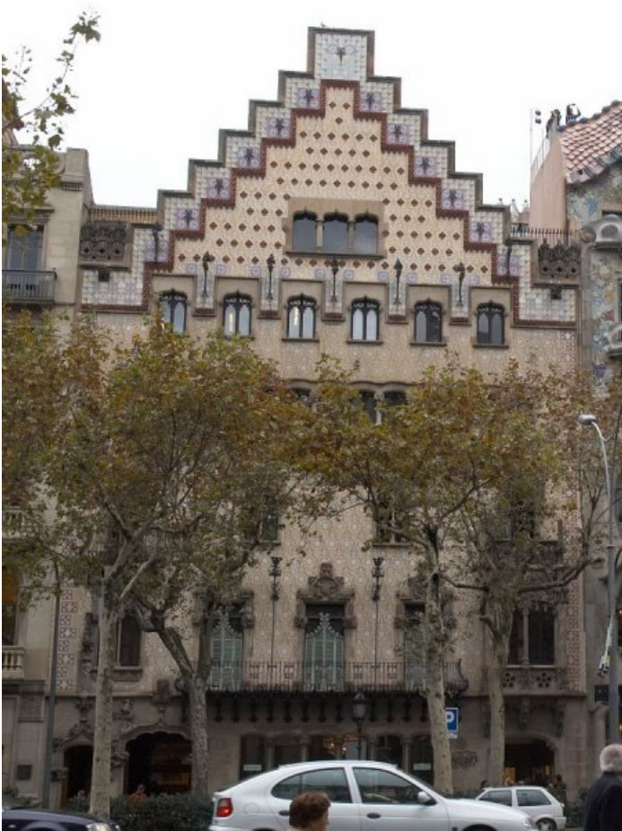
Casa Amatller (by Josep Puig i Cadafalch)