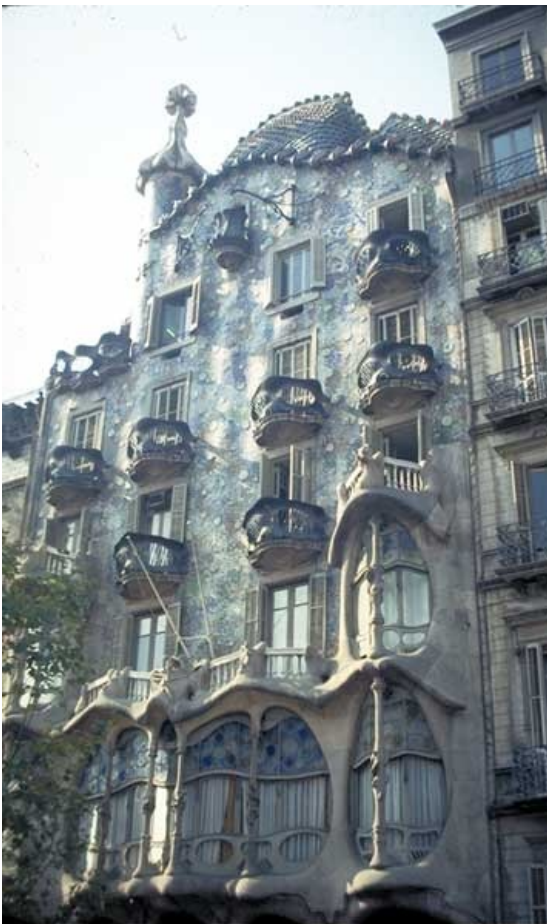
Casa Batlló (by Antoni Gaudí)