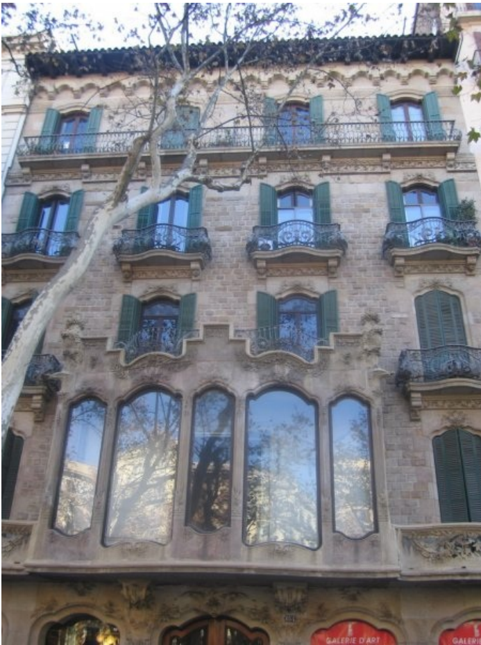
Casa Mulleras (by Enric Sagnier)